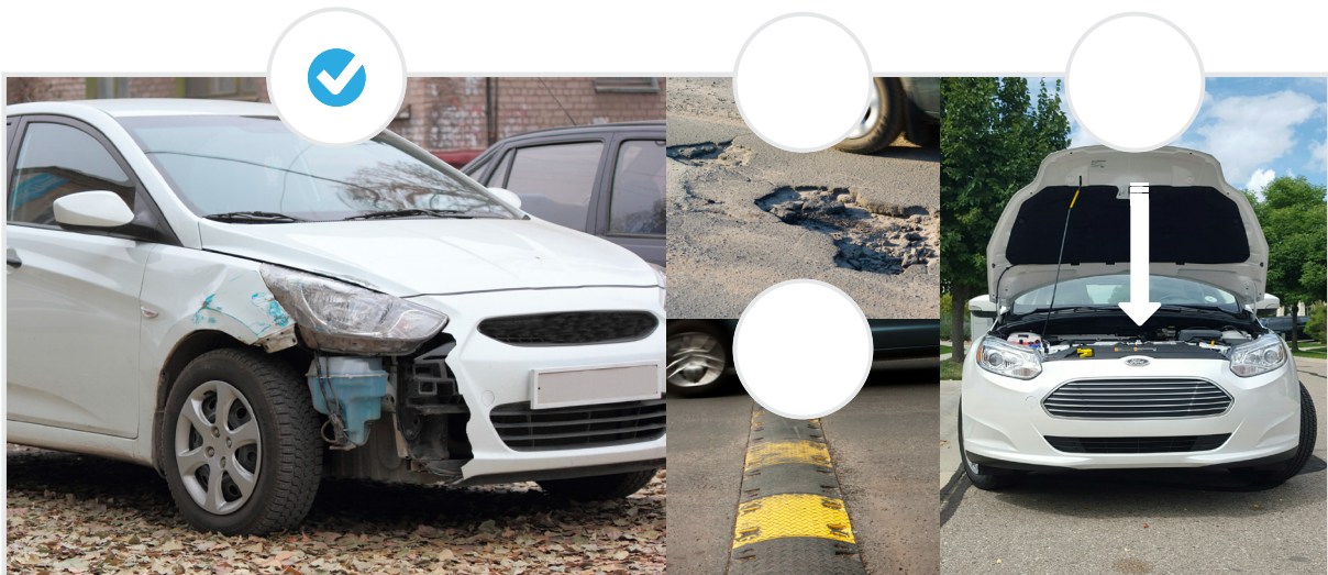
Figure 1 - The CrashCode application discriminates between actual crash events and non-crash noise, such as pot holes, speed bumps, and hood or door slams.

CrashCode is engineered to meet the demands of insurers and fleet managers who want to automate accident reporting and access reliable, actionable intelligence in real time for claims operations. It has been tested extensively using controlled and instrumented vehicle-to-barrier, vehicle-to-vehicle and field data from a large number of crashed cars. Reliability is essential, and in testing, CrashCode achieved a 98.6 % success rate in discriminating between crash and non-crash events.